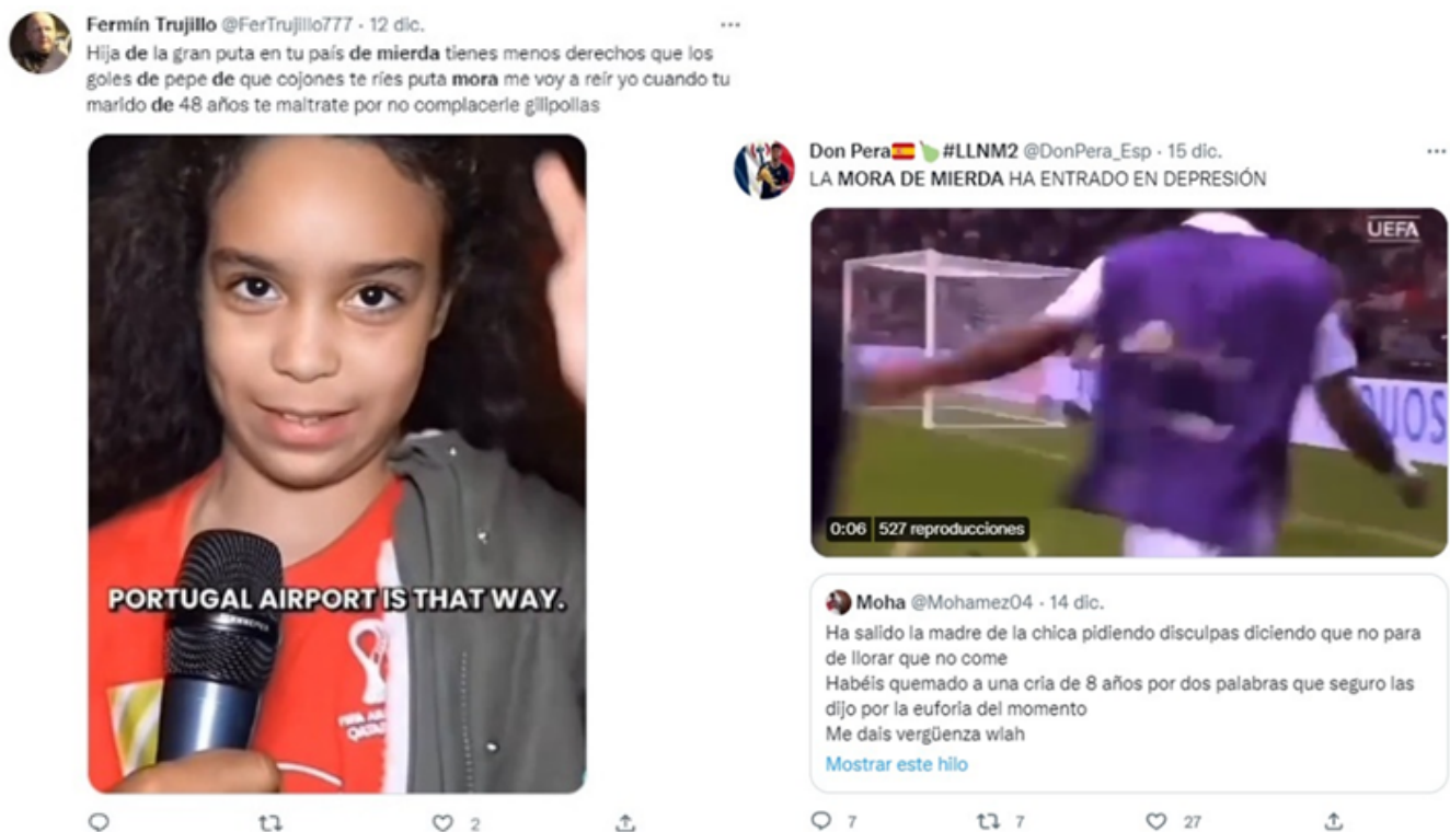
Figure 11: The last case was centered on Moroccan child who became the target of severe criticism after going viral on social networks for her statements about the soccer player Cristiano Ronaldo after Portugal's elimination from the Qatar 2022 World Cup. The declarations of the girl caused a spiral of messages between Ronaldo's fans insulting and referring offensive words to the 9 years-old children.