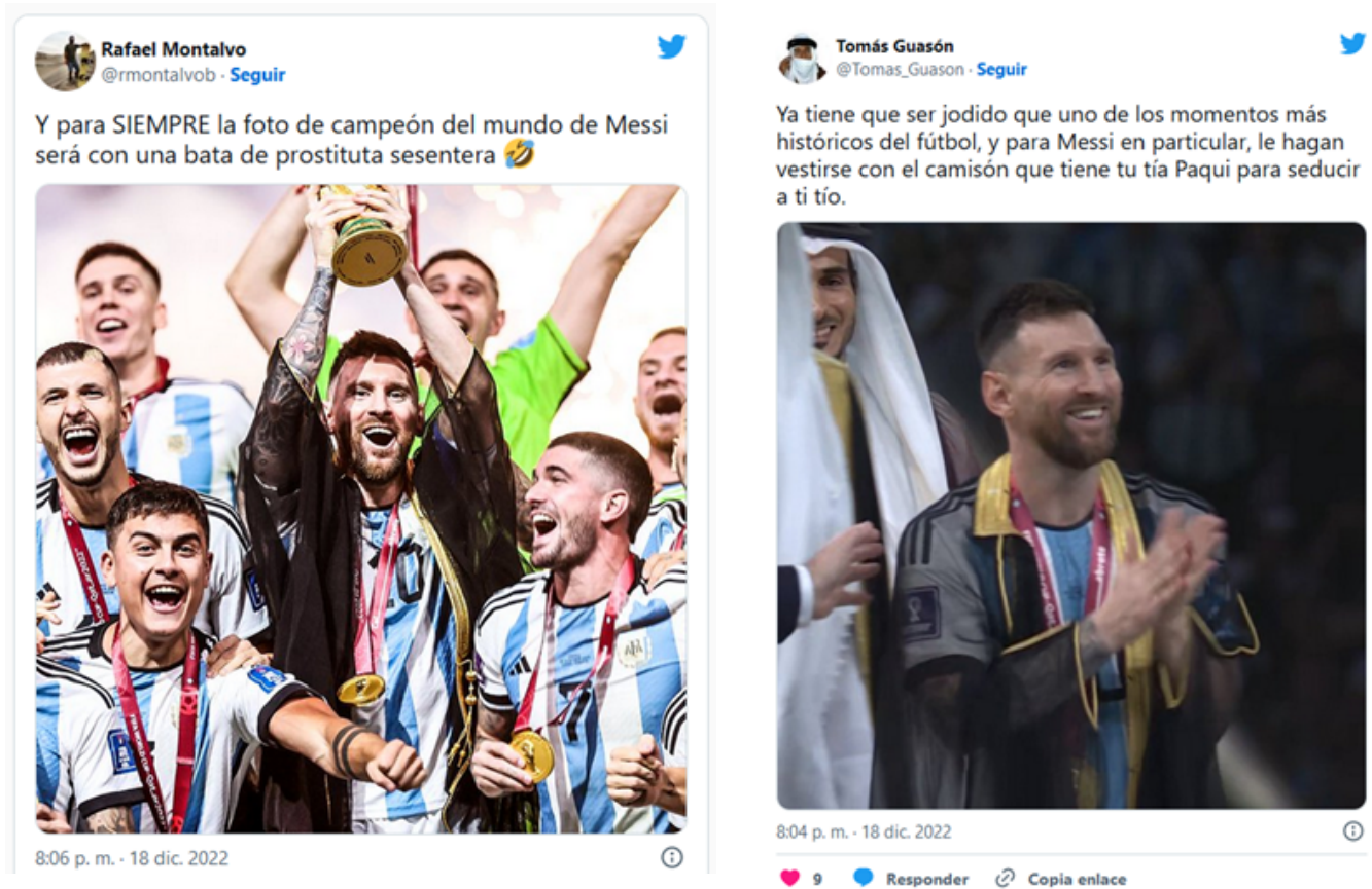
Figure 4: The reaction was immediate and disrespectful comments about Qatari traditional tunic was posted. The users compared it with “70s prostitute robes” and “nightdress that old women use to attract their husbands”.