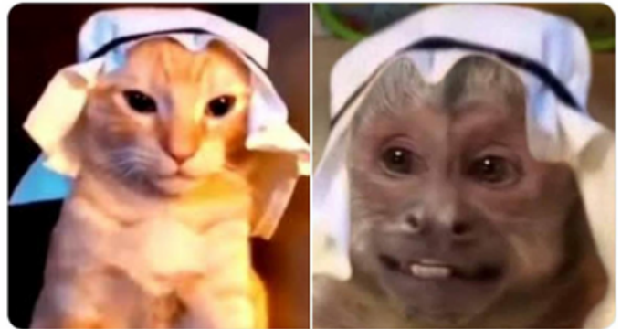
Figure 3: In the case of the World Cup, a series related to Qatari traditional clothes became viral in form of caricatures. In the first meme, a cat and a monkey were dressed in the traditional Qatari turban, named TURB, which the user identify as a tablecloth while the second meme shows a series of jam bottles under the title “how strange is the inaugural ceremony of the Word Cup”.

However, the most viral content related to cultural traditions in Qatar was memes about the closing ceremony where Sheikh Tamim bin Hamad Al Thani, Emir of Qatar, place a traditional Qatari tunic on the shoulders of Leo Messi. The tunic called bisht is a long cloak made out of light, often sheer, a material with trimming made out of real gold that is worn over a white thobe for special occasions. It is viewed as a sign of appreciation and respect and is typically worn by royalty, dignitaries, sheikhs and other high-status individuals. According to experts, it is like a mark of honour, and just kind of a culturally welcoming and a cultural acceptance[8].