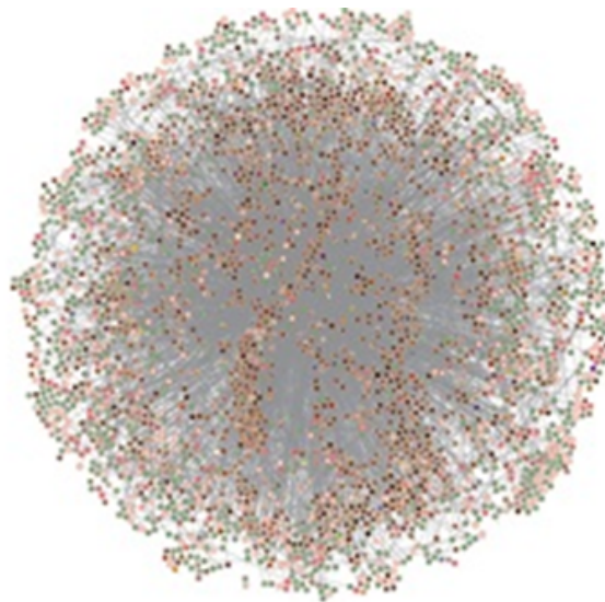
Figure 7: Interactions on the hashtag "leña el moro".

The following post shows two classical plays in the 80s-90s with the sentence: "The moors are like this shit. They are useless but funny when you throw them down the stairs". Despite the calls made by public authorities such as Spanish Government, LEAS and Morocco Embassy in Spain to enjoy the match with respect, responsibility and tolerance, users continue sharing authorities' posts under the same hashtag. Another common reference that became trending on social media in that days was Martes de Xenophobia (Xenophobia Tuesday) suggesting that the day of the match was the turn to be xenophobic.