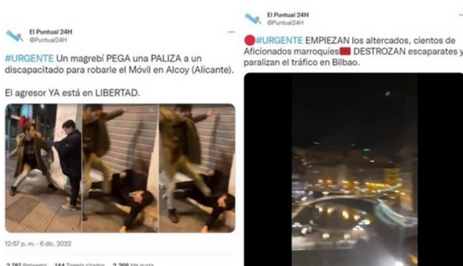
Figure 10: On the other hand, a series of fake news continues to circulate paying attention to the false violent celebrations of Moroccan fans. Online content included false information claiming stereotypes like the “violent character” of Moroccans; fake news about Moroccan beating disabled people and Moroccan fans raping Spanish minors; and also fake news about fires, extensive damages and crashes with the Police in different cities. Despite public authorities denying this information, the posts became viral.