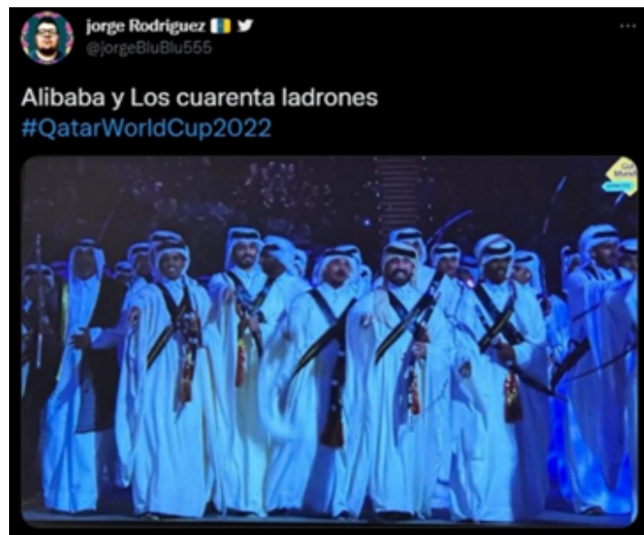
Figure 5: A picture of the Qatar Ambassadors in the Opening Ceremony of the World Cup was also accompanied by the Orientalist comment “Alibaba and the 40 thieves”, one of the best-known stories in The Thousand and One Nights. This phenomenon is observed as a rejection of Muslims and their symbols in public spaces or in form of debates about the use of traditional clothes, for example.