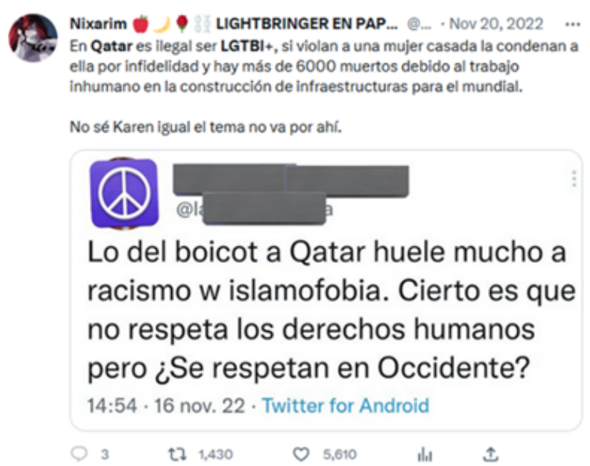
Figure 2: Other users emphasised on social media the violation of human right in Qatar using misinformation messages. While one user was denouncing a boycott campaign to Qatar and hypocritical behavior in media with the occasion of the champion, some users replayed with misinformation about the conviction of married women for infidelity when raped.