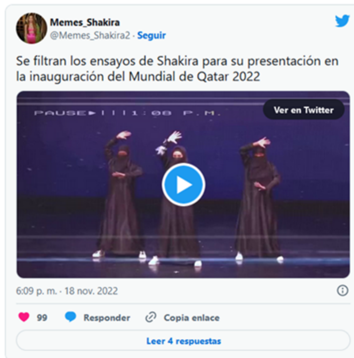
Figure 1: An image of a group of women dressing niqab was shared to refer to Shakira's dancing trials for the opening ceremony. Reactions to this post represents the two different images of Muslim women that are usually portrayed in the social media. On the one hand, modern Arab/Muslim women, and on the other, traditional hijabi women. The first one is represented as a paradigm of modernity. The second one is reduced to the category of traditional religious women who are considered passive, submissive and victims of an Islamic patriarchal society.