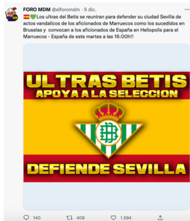
Figure 8: This report found that ultras posts were tendency in all the regions of Spain, including also Andalusia where the main extreme right ultras Supporters Sur from Betis shared similar images to M.D.M. The Hispameme account also posted a video mixing images of the Spanish team, photographs of the Army, Spanish flags and other images of the "reconquest", Islamophobic cartoons, images of the Melilla fence and migrants being beaten by the LEAS.