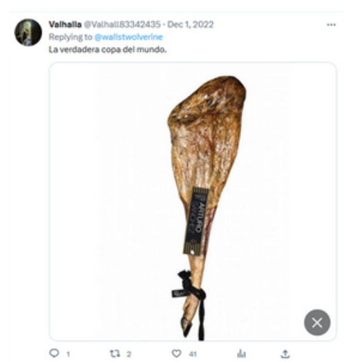
Figure 9: Other users shared the image of a match between two Spanish teams in which one player wearing a football uniform sponsored by an Iberian Ham brand under the title: "Spain will wear a new uniform for the dispute with Morocco in the quarterfinals". Some of the reactions show a ham as the real World Cup.

The response on social media after the Spanish team lost the match was based in two points. On the one hand, xenophobic content based on the so-call morofobia under the title putos moros de mierda (fuking moors of shit); fuera de nuestro país moros de mierda (get out of our country Moors of shit), and similar claims.