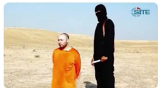
Figure 6: Other users were further and shared different images suggesting that VAR (Video Assistant Referee) was controlled by what they assume are terrorists. The first one represented a Taliban as a referee in the VAR. The other one shows the first video of the ISIS execution above the sentence: "the VAR revising".