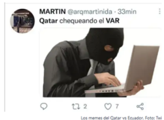
El var revisando