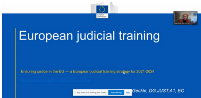
EU Policy Officer at the European Judicial Training Unit, presented the core of the European Commission (EC)

In this regard, another interesting point that emerged from the IVC concerns precisely the need for direct contact with foreign counterparts . Speakers from Belgium, Germany, the Netherlands, and Poland stressed the relevance of direct contact, i.e. by meeting foreign colleagues to discuss,