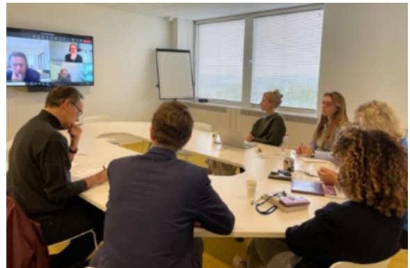
The Dutch Roundtable, held in Utrecht on the 23rd of October 2023

In Austria, the national transferability of already identified international Promising Practices was discussed, exemplified by a case between Italy and Austria. In the case of transfer adaptation ab initio, practitioners emphasized that the recognized advantages of such a procedure would not outweigh the possible obstacles that practitioners would then face, such as time pressure and administrative burden . Concerning the existence of national central authorities for cross-border judicial cooperation and proceedings, practitioners were in favour of such an institution but raised several follow-up issues, such as the exact responsibilities or the necessity of such an authority considering the few national cases that fall under the FD's jurisdiction.