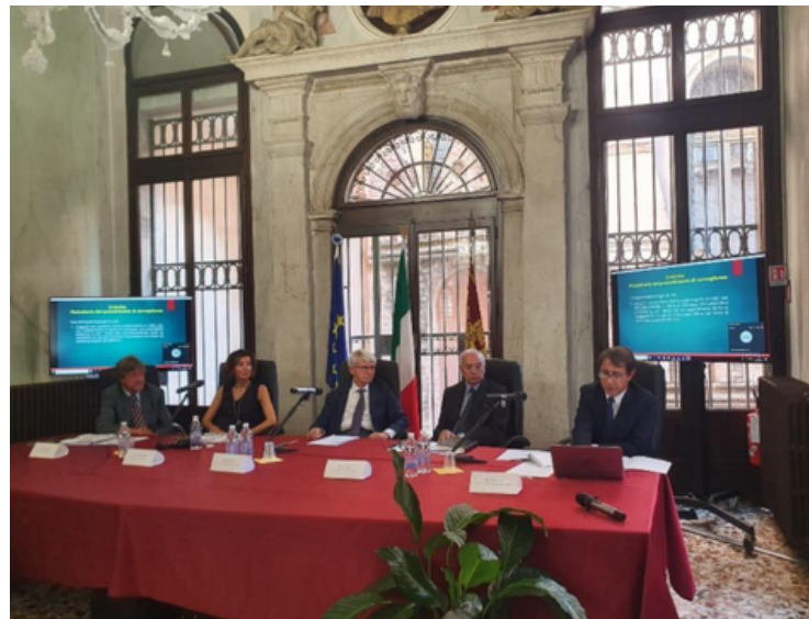
The Italian Roundtable, held in Venice on the 29th of September 2023

In total, the events were attended by 75 practitioners from the judicial sector.