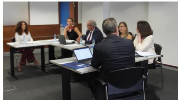
The Portuguese Roundtable, held in Lisbon on the 10th of October 2023

The Belgian practitioners signalled the decisive importance of obtaining and consolidating meaningful and sustainable flows of information , both cross-professionally and cross-nationally.